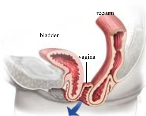
Figure 1 - Vaginal Vault Prolapse